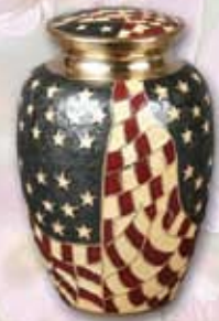
Old Glory $175