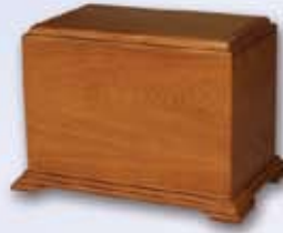
Fairhaven Ash $135