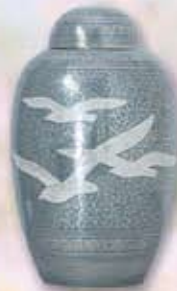
Going Home $175