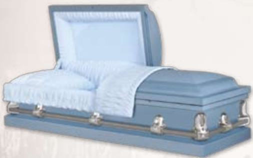
Casket included – other colors available