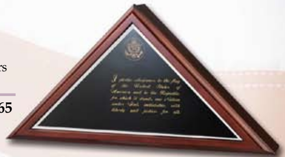
Arlington Flag Case $175