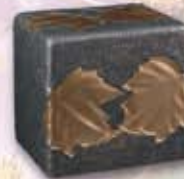
Seasons Bronze Companion $275

*Available in Emerald, Blue, Rose or White