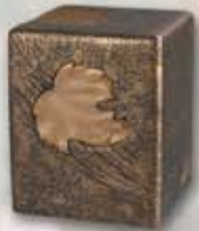
Seasons Bronze $165