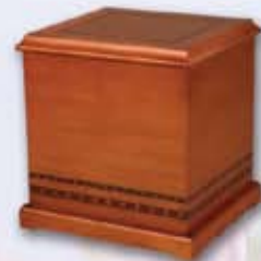
Alexander Companion $300