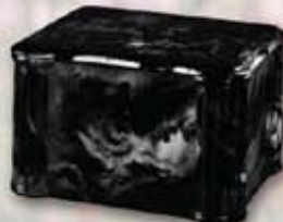
Ebony Marble* $215

*Available in Emerald, Blue, Rose or White