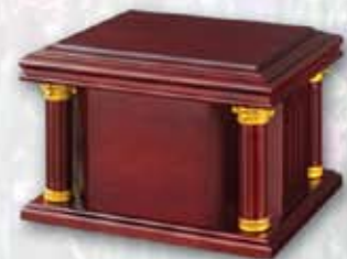
Classic Column $215

Urn not included - Suggested urn pictured - Choose from our wide selection of available urns. *Chapel services in Greater Kansas City location only.