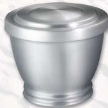
Spun Aluminum $65